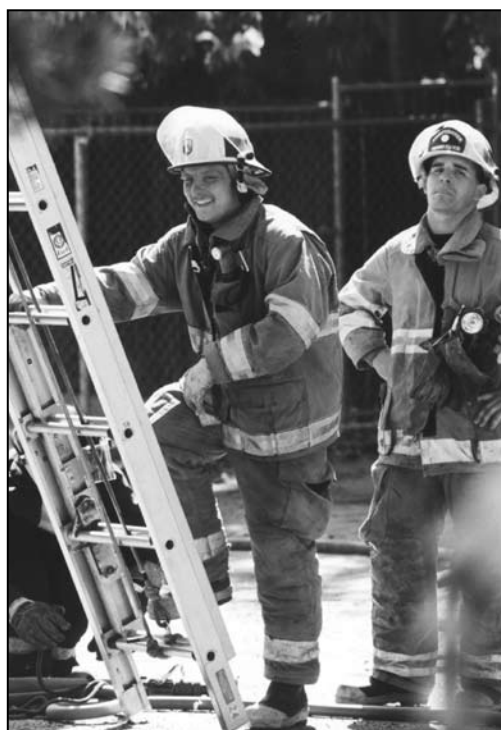
The Applied Technology Division trains over 4,000 future fire fighters, law enforcement and emergency medical technicians from Fresno, Madera, Kings and Tulare counties.