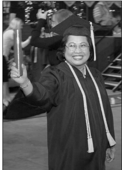
Commencement and certificate ceremonies are held each May to celebrate student achievements.

A candidate for an associate in arts degree, associate in science degree or a certificate of achievement must file a graduation application for the degree or certificate. An application for graduation for a degree or certificate of achievement will be accepted when a student is within a year of potential graduation and/or completion. A student who needs a formal evaluation prior to the year of graduation/completion may appeal this policy by providing evidence of special program requirements. Application deadlines are listed in the academic calendar of this catalog. No student is a candidate for graduation until the application is completed. Graduation ceremonies for degree candidates are held at the end of the spring semester each year. Diplomas will be dated at the end of the semester or summer session in which requirements are met. Diplomas and certificates are mailed to successful candidates approximately two months after fulfilling graduation requirements.