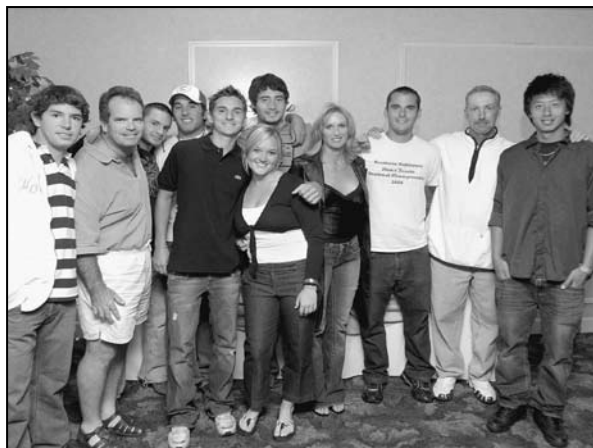
FCC students have a number of opportunities to celebrate their success. Here, the men's and women's tennis teams celebrate a winning season at a Commission on Athletics dinner.

In accordance with state law, the district recognizes the right of peaceful assembly and will make facilities available for recognized staff and student groups when such assembly does not obstruct free movement of persons about the campus, the normal use of classroom buildings and facilities, and normal operations of the college or the instructional program, and when it does not jeopardize the safety of persons, lead to the destruction of property, or violate the laws of the district, state or nation. Persons who are not members of the student body or the college and who violate this policy shall be subject to the control of public authorities.