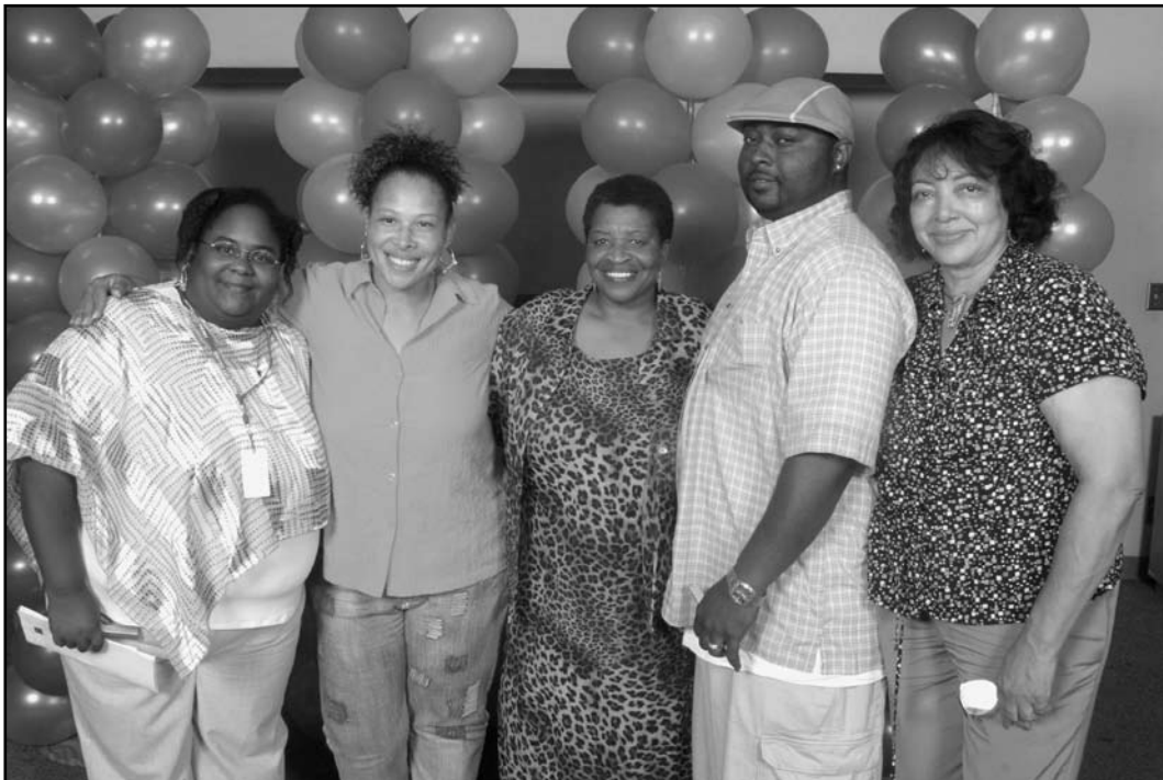
Through the generous contributions of local benefactors, a number of FCC students receive scholarships annually from the State Center Community College Foundation to help them achieve their educational goals.

* In all cases, unit load refers to units carried at Fresno City College.