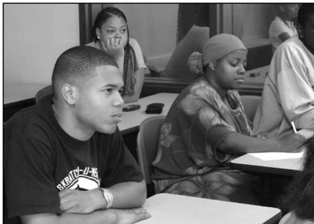
FCC provides a comprehensive student support services program to increase student retention, persistence and success.