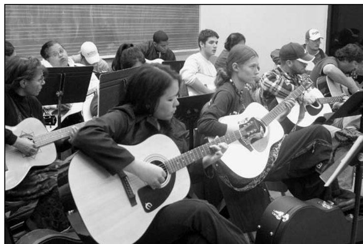
The Fine, Performing and Communication Arts Division provides students with a wide variety of opportunities to develop their artistic talents.

The Communication Arts Department offers courses in film, speech, and journalism. Students may select courses to fulfill general education requirements and courses for majors in speech and journalism. Students enrolled in the journalism program have the opportunity to gain valuable experience in the production of the college newspaper, The Rampage .