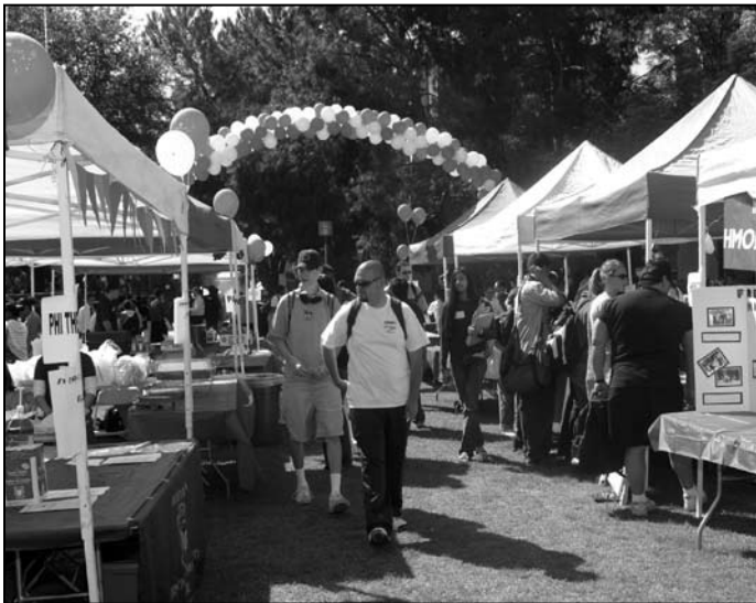
Students enjoy campus life through a variety of activities that include cultural events and the annual Showcase Open House.

Office for Civil Rights U.S. Department of Education 221 Main Street, Suite 1020 San Francisco, CA 94105