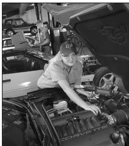
Master certified instructors in the Applied Technology Division prepare qualified automotive technicians in the most advanced automotive technology.

Associate in science degree requirements can be found under degree requirements on page 36.