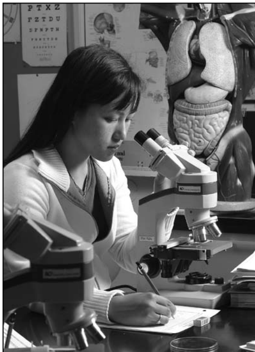
Exceptional faculty in the Math, Science and Engineering Division provide students the solid foundation they will need to successfully transfer to four-year institutions.

A refund policy for Associated Student Body membership has been adopted by the students. This policy provides for full refund during the first week of classes and one-half refund during the second week. No refunds will be made after the second week.