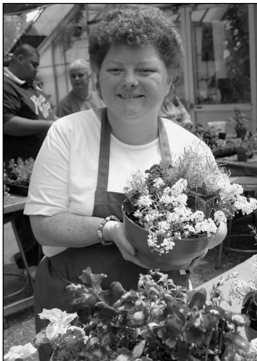
The Adaptive Ornamental Horticulture program provides students with disabilities hands-on gardening experience that helps them acquire employment skills.