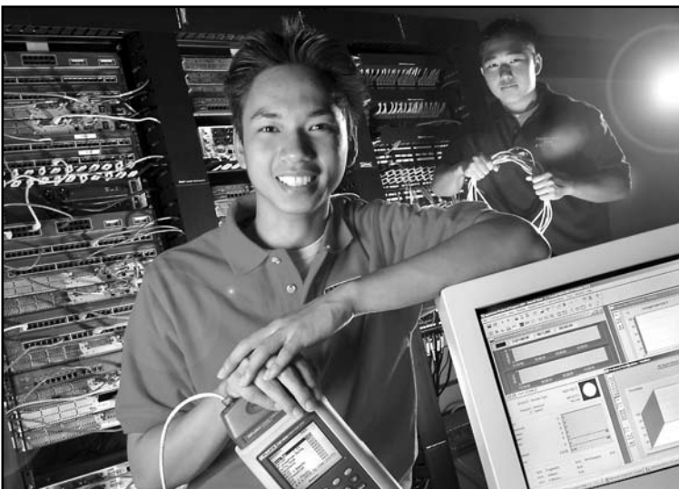
Networking programs in the Applied Technology and Business divisions prepare students with the necessary skills to be successful in one of the fastest growing industries.