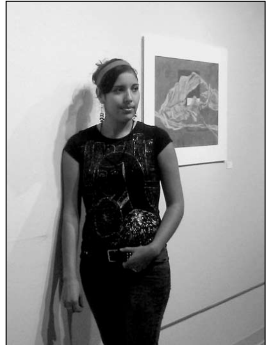
The Art Space Gallery hosts several exhibits each year showcasing works of local artists, faculty and students.

Original works by students and faculty are staged twice during the academic year. Students may also be invited to participate in the American College Dance Festival during the spring semester.