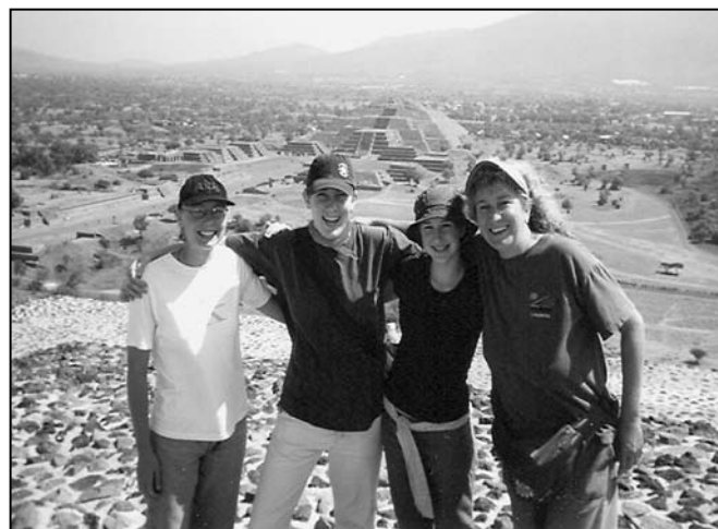
The Social Sciences also participates in numerous study abroad programs, such as this class which studied archaeology in Mexico.