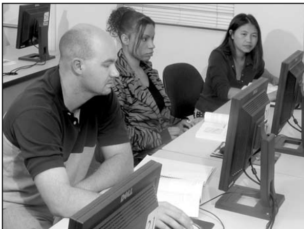
FCC offers a number of short-term training programs that prepare students to meet local workforce requirements.

Permission to enroll in excess of 18 units is granted only when unusually high scholarship and urgent need prevail. Counselors can approve a student request to take 19 to 21 units. Students who wish to take 22 or more units may obtain a petition for this purpose in the Counseling Center.