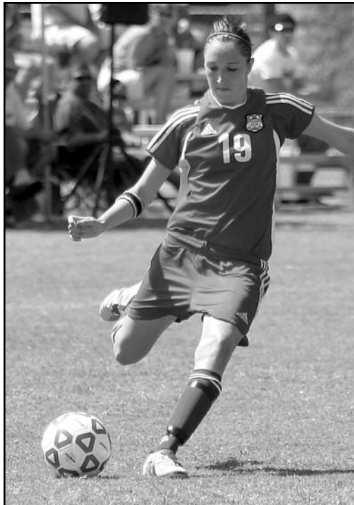
FCC intercollegiate athletics programs continue a rich tradition of excellence. Over 500 student-athletes compete on 19 teams in both men's and women's sports.

Athletics at Fresno City College, as with all California community colleges, is governed by the general regulations of the State Community College Athletic Code as well as the specific regulations of the conferences in which Fresno City College holds membership.