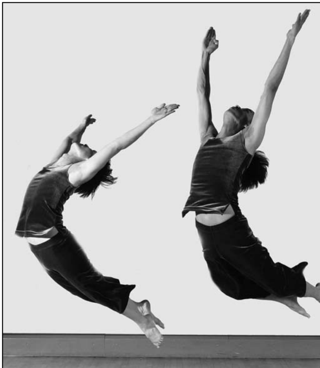
The Theatre Arts and Dance Department at FCC provides students with extensive training by expert instructors. Each course that is taught and production that is staged emphasizes a hands-on approach and places special focus on producing a “well rounded” theatre artist.