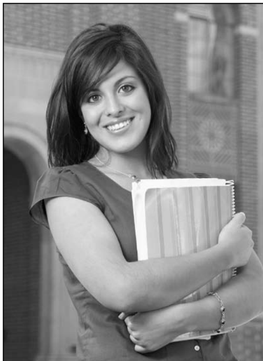
Student leaders play a vital role on campus representing the interests of students in the Associated Student Government and as student trustees.

that they attend each and every class meeting (for 18 week semester courses, this is the first 3 weeks of class).