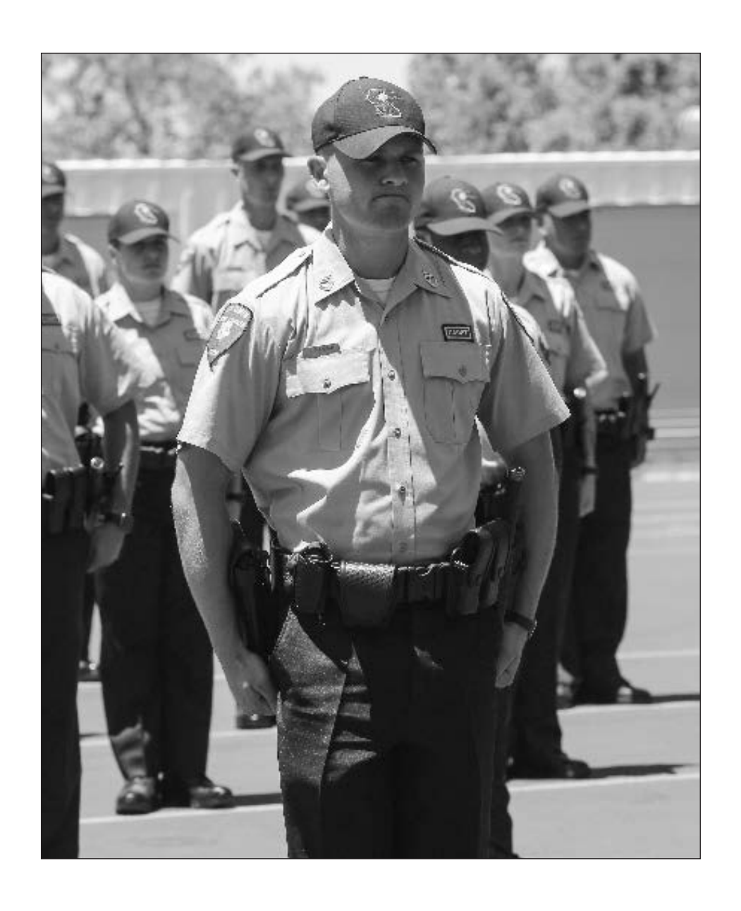
A Public California Community College